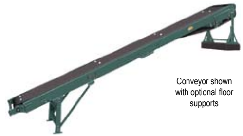
Conveyor shown with optional floor supports