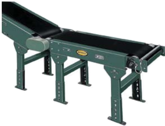
SHOWN WITH OPTIONAL LOWER POWERED FEEDER AND SUPPORTS

FLOOR SUPPORTS —Now supplied as optional equipment.