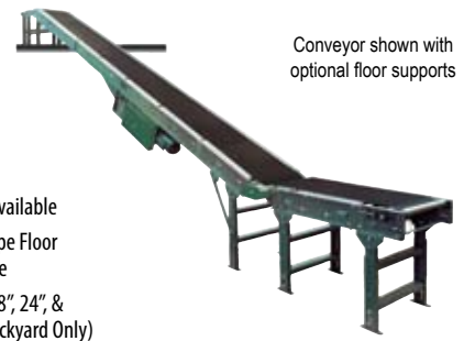
Conveyor shown with optional floor supports