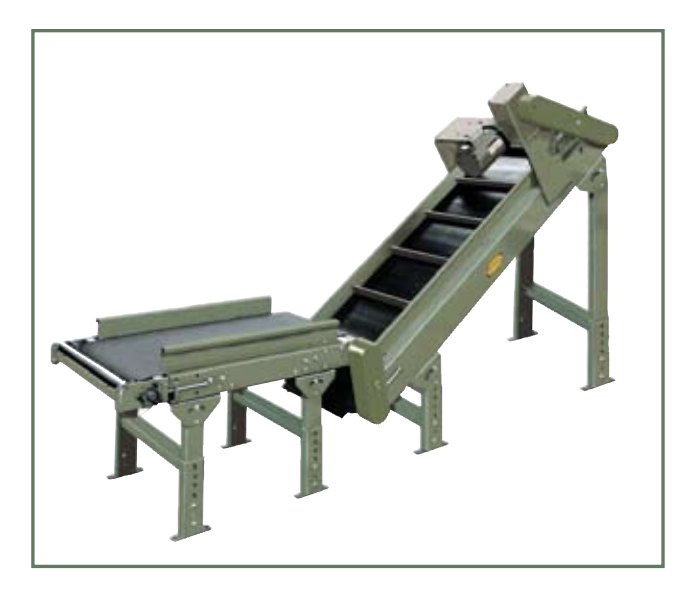
FEEDER SHOWN WITH STANDARD PC TYPE GUARD RAIL, GRAVITY BRACKET WITH POP-OUT ROLLER AND OPTIONAL MS TYPE FLOOR SUPPORTS

CAPACITY—300 lbs. total distributed load at 65 FPM.