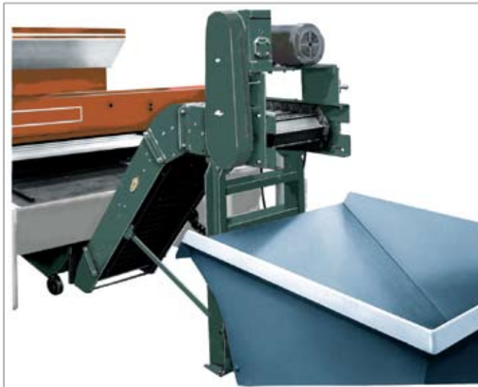
Model PCH design makes it ideal for positioning into or under punch presses and similar equipment. Horizontal discharge section allows easy positioning of hopper or drum for parts collection.

FLOOR SUPPORTS —Now supplied as optional equipment.