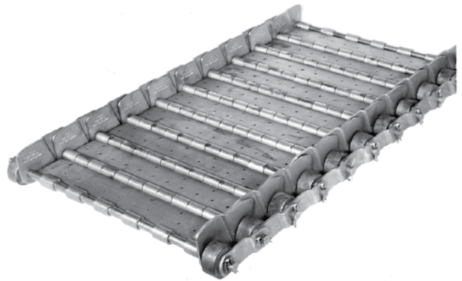
Metal Piano Hinge belt provides continuous reliable service. Construction is heavy-duty with perforated apron plates and solid steel, heat-treated rollers.