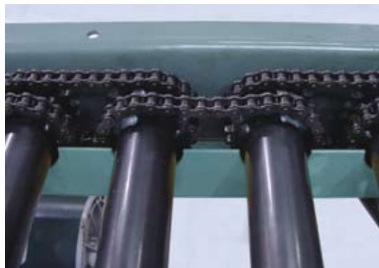
CHAIN GUARD REMOVED TO ILLUSTRATE ROLL TO ROLL DRIVE CHAIN.

WARNING: DO NOT OPERATE CONVEYOR WITH CHAIN GUARD REMOVED.