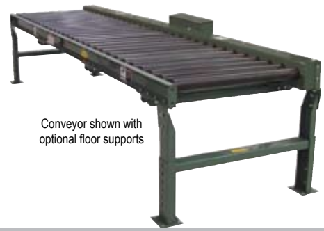
Conveyor shown with optional floor supports