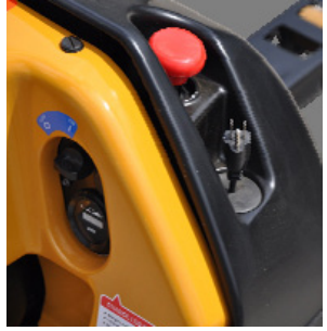
Battery discharge indicator, key switch, emergency power disconnect and built-in automatic battery charger.