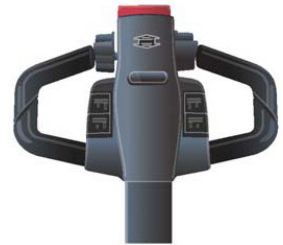
Ergonomic Operator's Handle