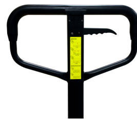
Comfort Grip and Easy Access Controls