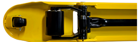
Entry / Exit Rollers