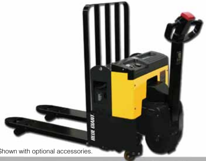
Shown with optional accessories.